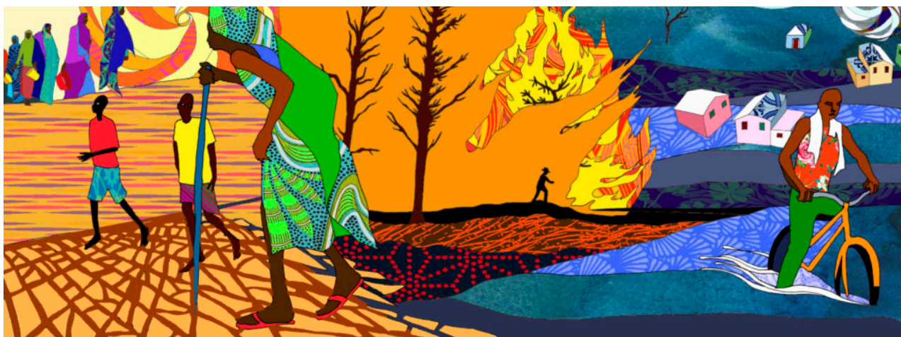
Christopher Myers, How to Name a Famine, a Fire, a Flood? (Fort Gansevoort)

In the rather epic “How to Name a Famine, a Fire, a Flood,” Myers directly addresses global headlines about the climate crisis in a fairly literal tableaux illustrating the title. But his expert conjuring of precise landscapes, pictorial space with Grant Wood-inspired depth of agrarian rolling-hill perspectives and deftly rendered figures make the deeper message more explicit still. The looming climate crisis affects us all, but the poor and communities of color can be expected to bear the brunt of the disasters, earlier and more devastatingly than the privileged. For Myers this is more than academic or theoretical. He has traveled and worked all around the globe, maintaining a storytelling practice and a growing international family of artisans and collaborators, from whom he learns in an unceasing curiosity for stories, histories, experiences, techniques and enriching perspectives.