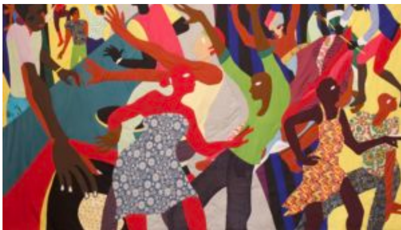
Christopher Myers, I Insisted that Our Movement Not be Turned into a Cloister, 2019, 96 x 168 inches

While the exhibition takes its title, Drapetomania , from an offensive and obviously debunked 19th-century pseudoscientific theory that posited slaves’ impulse to flee as a mental illness, the show’s most massive and architectural work, “The Talented Tenth and the Beauty of Existence” also takes science as a starting point. Data science to be precise, developed by W.E.B. Du Bois in 1900, and meant to account for accomplishment and beauty even amid global upheaval.