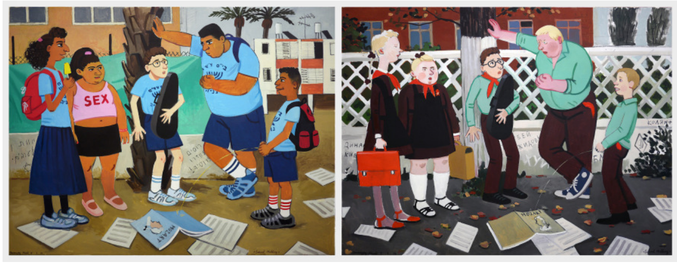
School Mobbing.