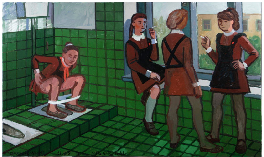
Girls' Toilet.