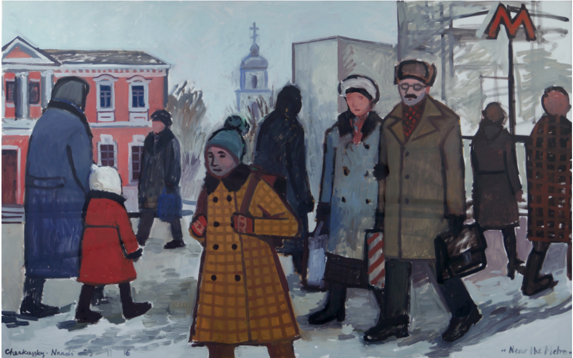
Near the Metro.