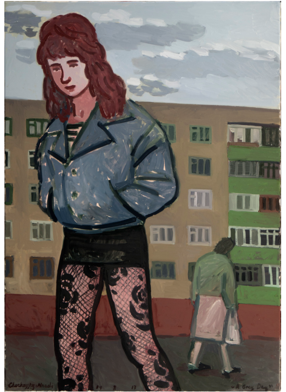
A Grey Day. Courtesy of the artist and Rosenfeld Gallery, Tel Aviv.