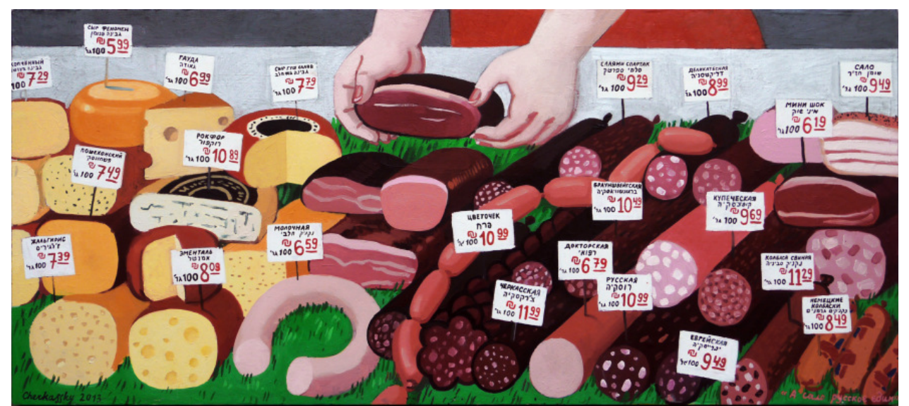
They Eat Russian Lard.