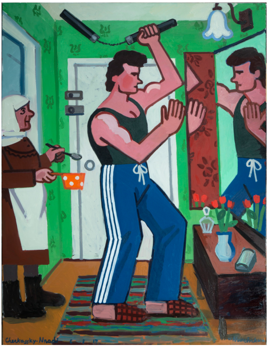
Nunchaku. Courtesy of the artist and Rosenfeld Gallery, Tel Aviv.