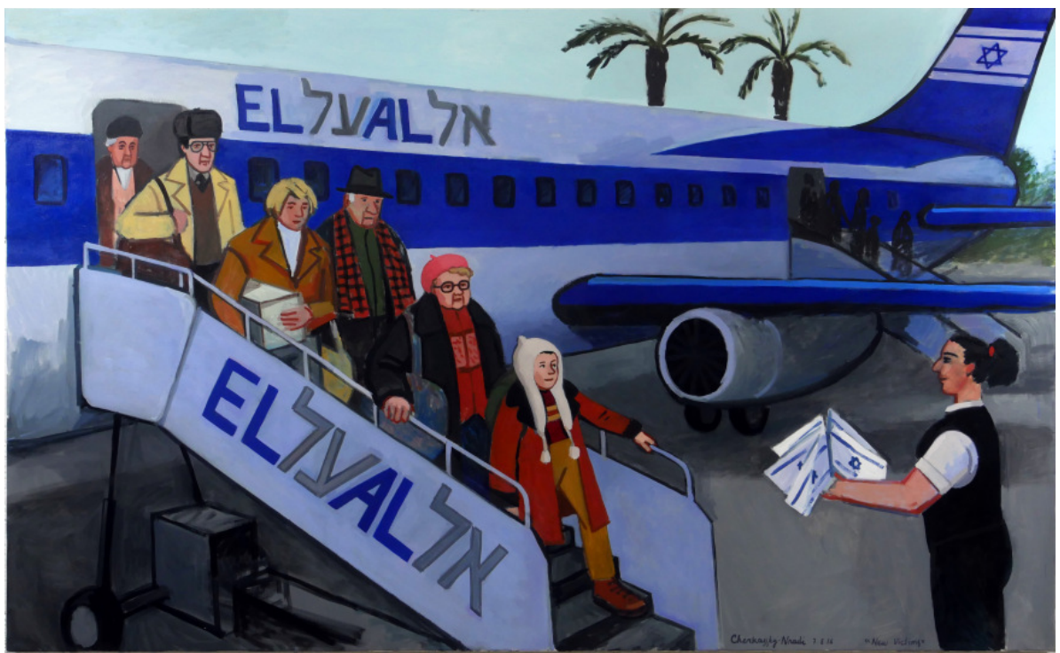
New Victims.

Düsseldorf, Germany and the Kuenstlerhaus Bethanien Residency in Berlin. Here are images from two of her recent series: The Russian Project (which was exhibited in <u>The Israel Museum</u> as "Pravda") and <u>Soviet Childhood</u>.