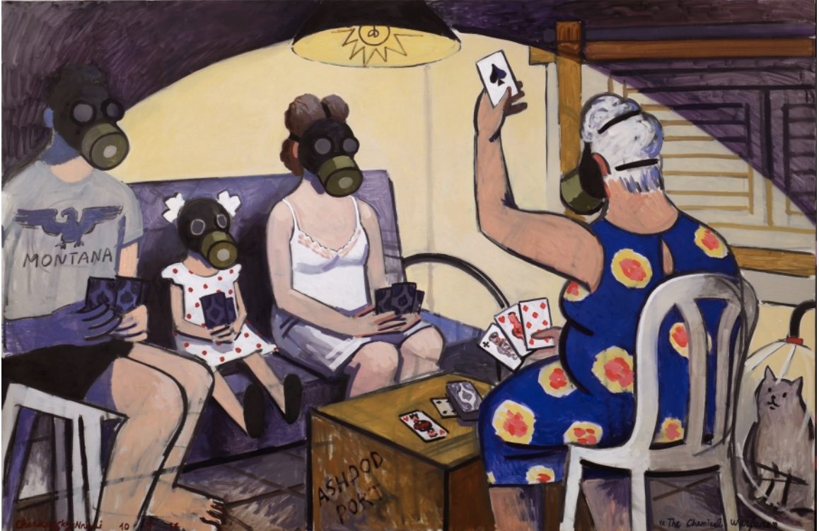
The Chemical Warfare.