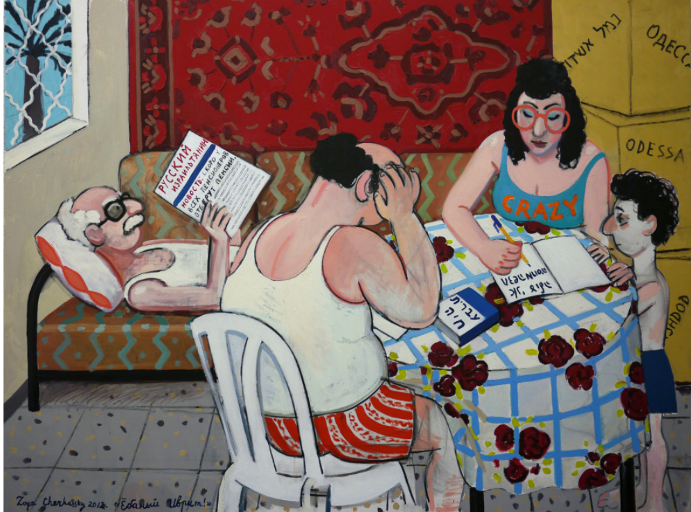
Fucking Hebrew. Courtesy of the artist and Rosenfeld Gallery, Tel Aviv.