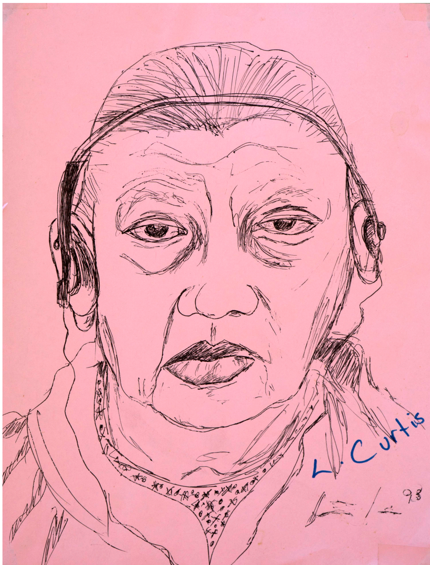
Michelangelo Lovelace 2008 Untitled , Ink on paper. 8.5 x 11 inches.