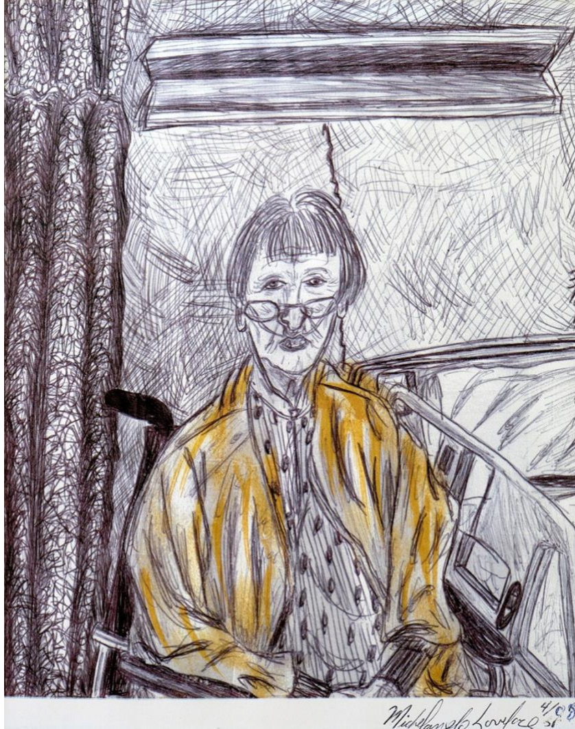
Michaelangelo Lovelace. Untitled , 2008. Ink and marker on paper. 11 x 8.5 in. Image courtesy Fort Gansevoort Gallery

These records of eye-to-eye exchange are complemented by scenes of the nursing homes' tiled halls and private living quarters where daily life takes place in a state of permanent quarantine. While strikingly medical and filled with the emblems of dwindling health, these incredibly detailed works burst with intricate patterns pressed up to the picture plane. Thickets of lines seem to convey layers of unseen energy and information, underlining a sense that the residents in these drawings have interior lives as active as their physical lives are still. A woman with breathing tubes reads intently in her bed, a man by a window observes the bustling city below from his wheelchair. Lovelace renders such precise moments with exquisite honesty.