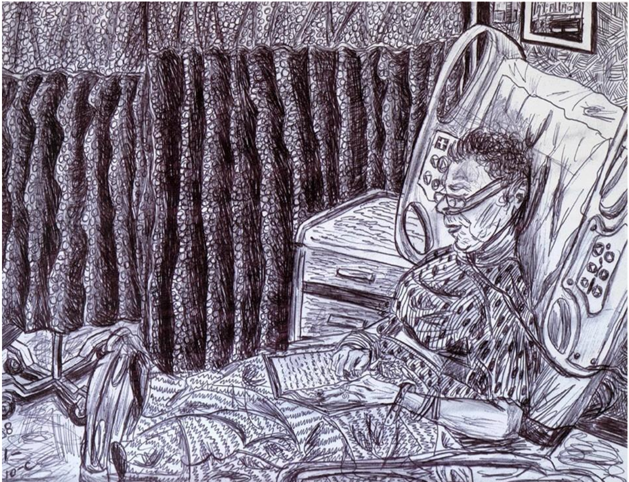
Michelangelo Lovelace, Untitled , 2008. Ink on paper. 8.5 x 11 in.