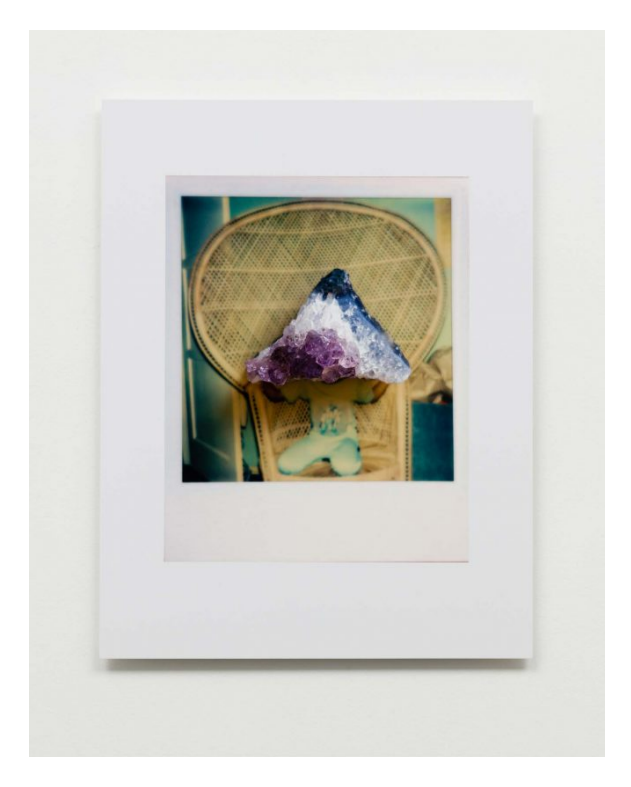
Sadie Barnette, Untitled (Gem), 2015. C-print, 30 x 24 inches.

Sadie Barnette offers a psychic vision of childhood in her photograph Untitled (Gem) , (2015). A child sits with legs under on a wicker chair—the one made infamous by Huey P Newton—with a gem, an amethyst specifically, situated in place of the figure's head. The photograph is slightly blurred in relation to the sharp lines of the amethyst, which hovers lightly in the child's hands. The gemstone is figured here as a cerebral treasure in which this youth of color is the arbiter of its cognitive capacity.