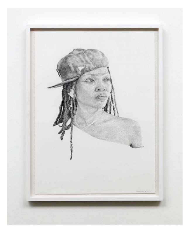
Kenturah Davis, Nkechi, from Infinity Series, 2016. Hand-written graphite text on paper, 38 x 261/4 inches.

Ramiro Gomez's This Is Not Your Pool (2013) and Kenturah Davis's Nkechi, from Infinity Series (2016) and K, From Infinity Series (both 2016) figure brown and black subjects as textual renderings. Gomez places a pool cleaner as the only subject in the image of an affluent home scene. A refusal of laborers' erasure within the maintenance of wealth, Gomez dutifully paints the indispensable brown latinx bodies which sustain place. Davis's pieces use the phrase "I lived to be infinity" to structure images of black subjects. The phrase "I lived to be infinity" which is legible in moments and fully concealed in others pivots the subject of the series as a liminal figure. Her use of text as the materiality in which black bodies come into being weds language as a tangible structure to blackness as a process of becoming. Both projects work as portraiture of another kind, assessing the vitality of people of color within the quotidian.