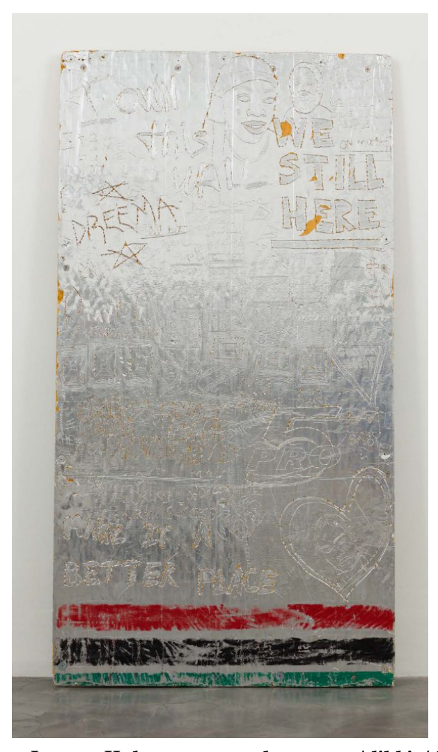
Lauren Halsey, og marvelous marv / lil bit / keep it clean, 2016. Foam and glitter, 96 x 48 inches.

In the main gallery Lauren Halsey's silver canvas's og marvelous marv | lil bit | keep it clean (2016) leans and glints against the wall. Consisting of two large rectangular pieces of foam wrapped in aluminum and masterfully etched, Halsey engraves figures with durags and headscarves—those that grace the packaging of black beauty supplies—next to phrases "WE STILL HERE," and "THEY KILLING US." There is a string of graffiti tags and advertisements for low-income housing, along with a series of faces captured in the outline of a heart and the repetition of "Together We Can" in distinct squares, likening the phrase to the signs of protesters. The shimmering foil is lined with red, black, and green stripes gesturing towards the colors of black liberation (Universal Negro Improvement Association and David Hammons's African American Flag) in urban America. Halsey gives us visions of blackness and black life, moments of the everyday in which protest, aesthetics, and ruminations on love are a shimmering pillar.