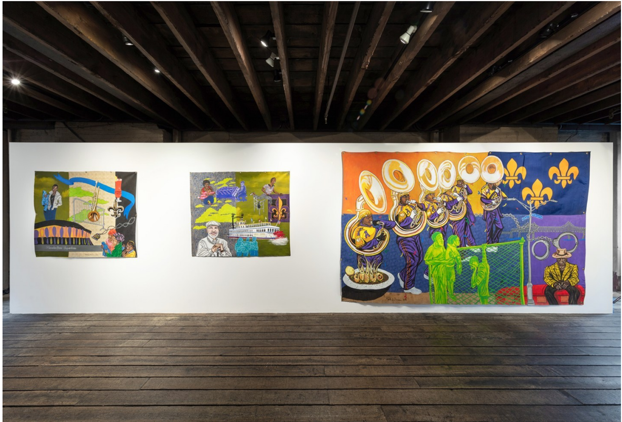
Installation view "Keith Duncan: The Big Easy," Fort Gansevoort, New York, N.Y. Shown, From left, "Times Picayune #8," "Times Picayune #7," "Majestic Messengers."