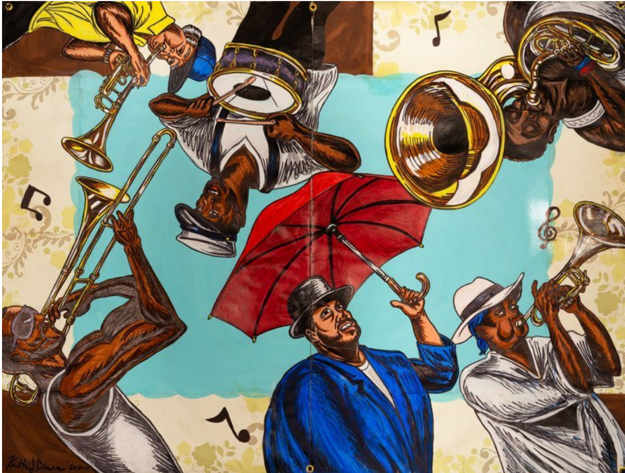
KEITH DUNCAN, "The Second Line #1," 2010-11 (acrylic on paper, 36 x 48).