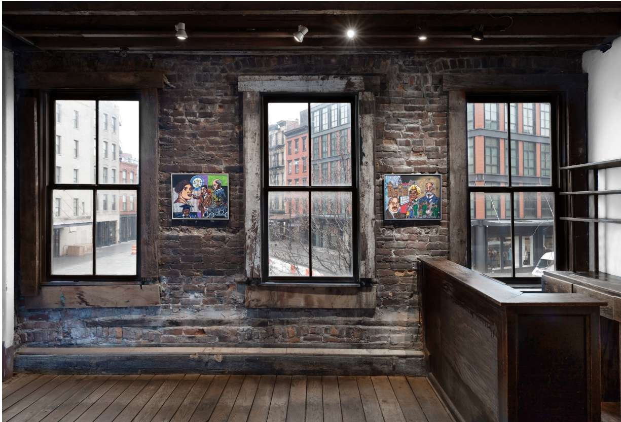
Installation view "Keith Duncan: The Big Easy," Fort Gansevoort, New York, N.Y. Shown, "Reconstruction Era" and "Black Inventors and Entrepreneurs Era."