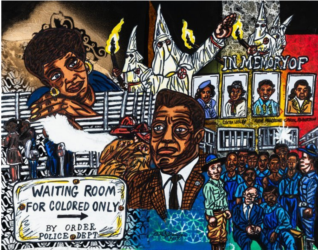
KEITH DUNCAN, "Jim Crow Era," 2017 (acrylic on fabric mounted on canvas 22 x 28).