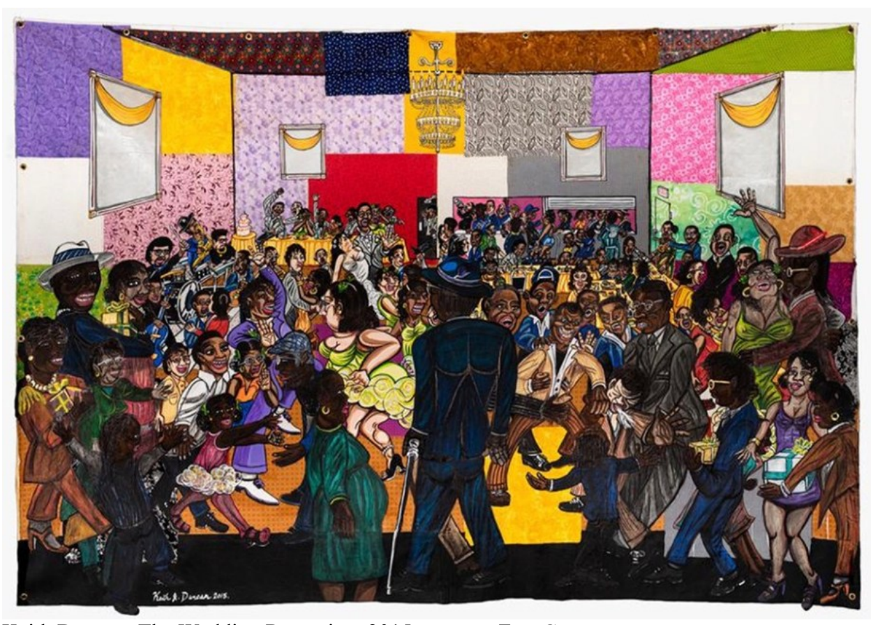
Keith Duncan, The Wedding Reception, 2015

Keith Duncan: The Big Easy opens at Fort Gansevoort