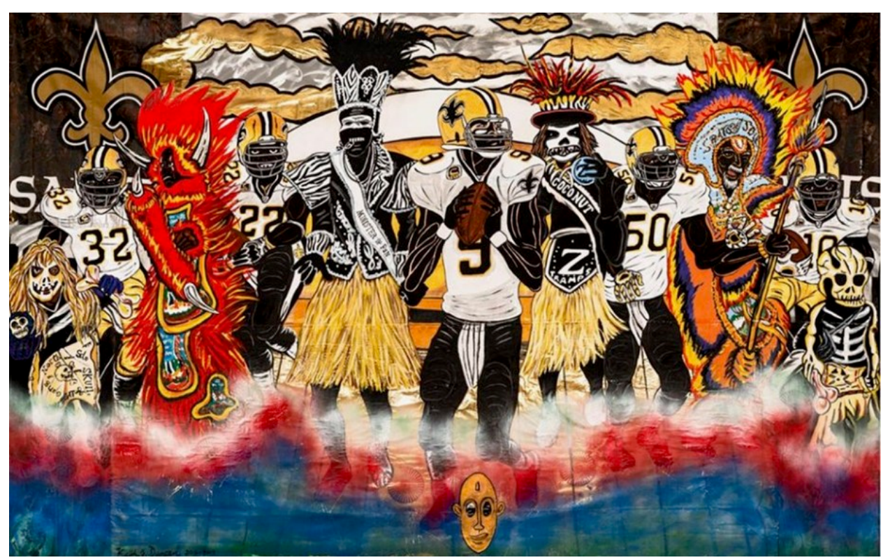
Keith Duncan, The Black Saints Go Marching In, 2016

The third body of work included in the exhibition is titled, Black Plight . This series consists of nine small paintings of historical events divided up thematically and by time period; such as Reconstruction Era , Civil Rights Era , and Black Star Era . The series culminates in one large painting that acts as a visual timeline highlighting moments of great progress in African American history, from slavery to the Obamas. Here also, Duncan makes use of patterned fabric as an homage to the work of the great southern women of Gee's Bend. Through a blend of material, historical references, events and icons, Duncan creates a multidimensional vision of the American South and more specifically New Orleans, Louisiana.