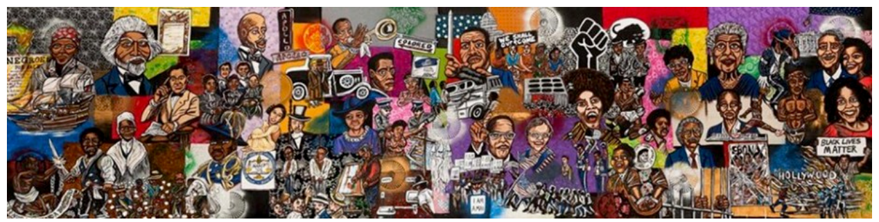
Keith Duncan, Black Plight, 2016 courtesy Fort Gansevoort

The Big Easy consists of two large-scale paintings portraying two scenes recognizable to all, The Wedding and The Funeral, both part of Duncan's series Satire and Storytelling. These are two scenes with curiously more similarities than differences. Through Duncan's expressive and at times comical form of visual storytelling, one will recognize many of the familiar characters in such scenes. The wedding is not without a couple of fights, the drunk uncle, and even a fainting bride. Similar roles are filled in The Funeral, including a separate party of men drinking outside of the reception created on the right side of the house. The bodies and heads of Duncan's figures are as if carved from a block of wood rather than paint, resulting in hyper-expressive faces. All of Duncan's chiseled faces can be seen at once. This rudimentary depiction of the many bodies filling the dance floor of The Wedding causes an effect reminiscent of procession paintings of The Renaissance, where every single figure's face can be seen fully by the viewer, giving little importance to the depiction of a realistic point of view.