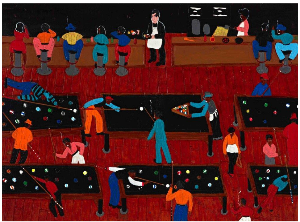
Title Unknown [Pool Hall], date unknown, dye on carved and tooled leather.