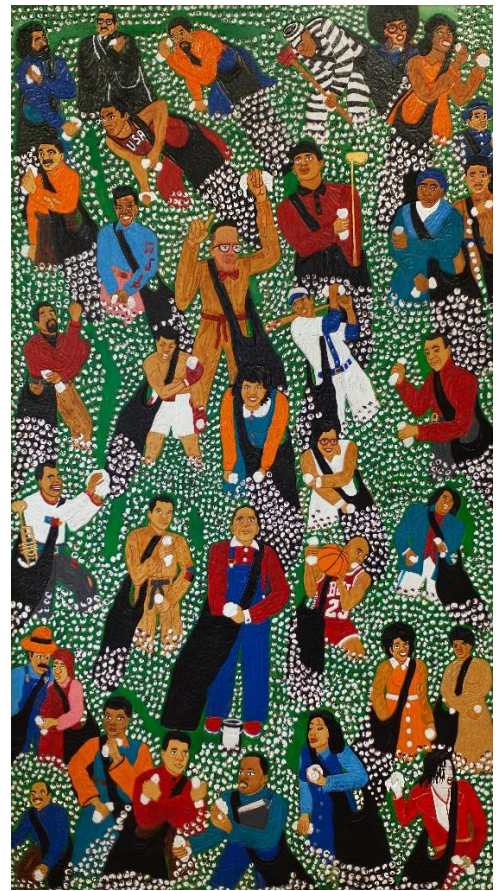
The Struggle, 2010, dye on carved and tooled leather.