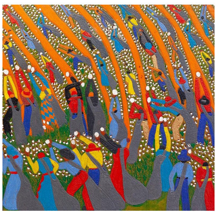
Sunshine II, 2012, dye on carved and tooled leather.