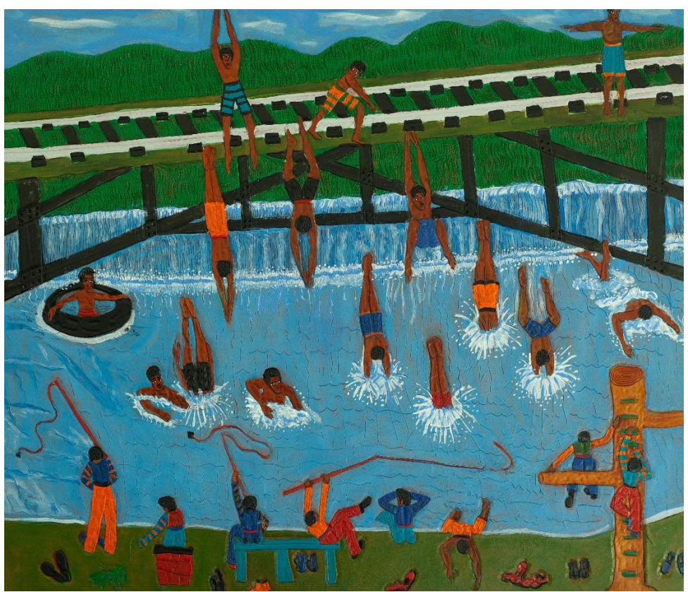
The Curvey, date unknown, dye on carved and tooled leather.