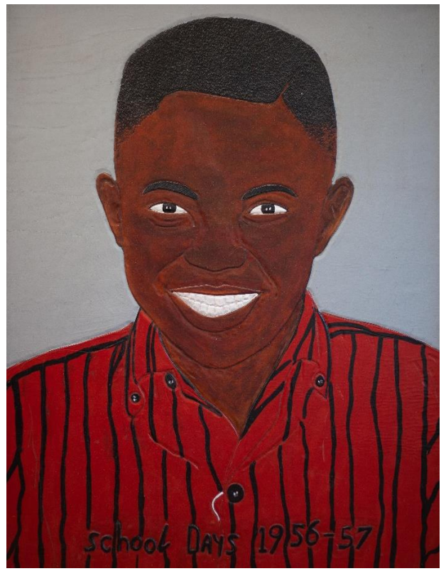
School Days 1956-57, date unknown, dye on carved and tooled leather.