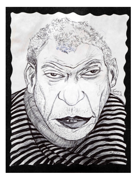
Michelangelo Lovelace, "James Speed" (1996), ink on paper, 11 x 8.5 inches

Three colorful day room scenes show a different kind of depth, with strokes of bright yellow marker setting the foreground for residents in common areas and long hallways. Ahearn <u>likens</u> these drawings to the wooden sculptures of Brazilian artist Aleijadinho, yet it is unclear exactly how they compare from the information provided. Really, they seem more in line with the artist's own streetscapes.