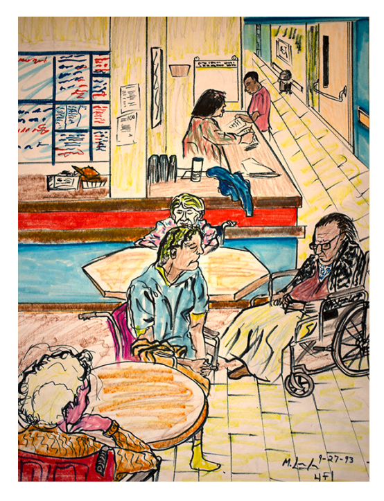
Michelangelo Lovelace, "Untitled" (1993), marker on paper, 23.75 x 18 inches

While Lovelace's most well-known paintings portray young people in urban settings, the drawings in Nightshift call attention to the oft-neglected facilities that have become hot spots of the COVID-19 outbreak. This exhibition feels timely for that reason, but also because the elderly deserve time in the spotlight. Nursing homes can feel lonesome, as Lovelace portrays in a <u>drawing</u> of a wheelchair-bound man gazing at a city skyline. But suffering is only one aspect of these vibrant communities.