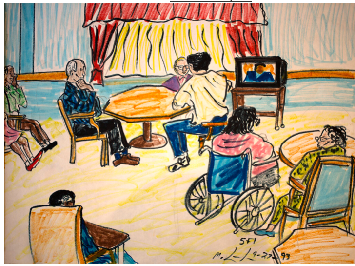
Michelangelo Lovelace, "Residents in the Day Room on the Fifth Floor" (1993), marker on paper, 18 x 23.75 inches

Three colorful day room scenes show a different kind of depth, with strokes of bright yellow marker setting the foreground for residents in common areas and long hallways. Ahearn <u>likens</u> these drawings to the wooden sculptures of Brazilian artist Aleijadinho, yet it is unclear exactly how they compare from the information provided. Really, they seem more in line with the artist's own streetscapes.