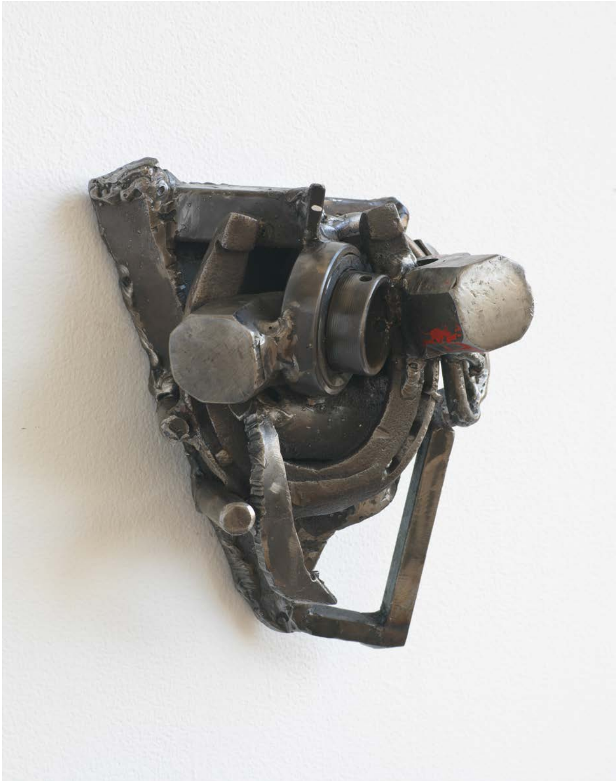
Melvin Edwards, Art Education, 2002.