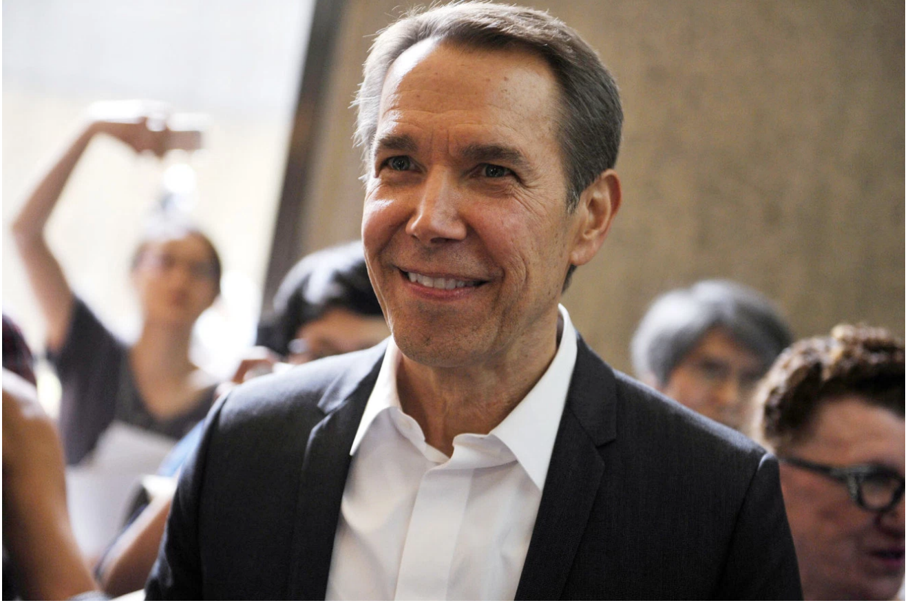
Jeff Koons