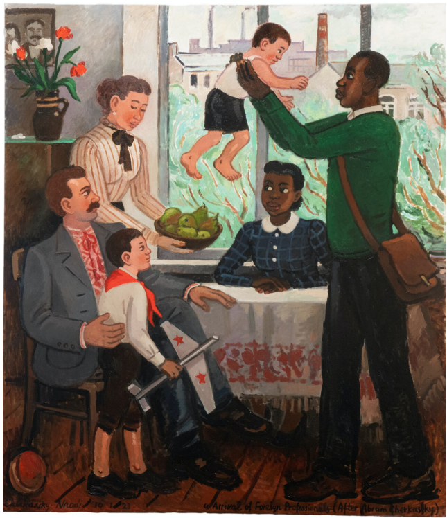
Zoya Cherkassky, Arrival of Foreign Professionals (after Abram Cherkassky), 2023, oil on linen, 69 × 55.25 inches. Courtesy of the artist and Fort Gansevoort. © Zoya Cherkassky.

Actually, there is a painting by my great-grandfather that triggered me to make my current show and also gave the exhibition its name. This is the kind of art I grew up on; and even before Socialist Realism there were older Russian art movements that were about storytelling, like Peredvizhniki (the Society for Traveling Art Exhibitions).