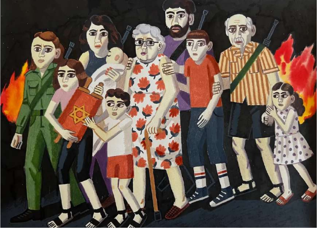
Zoya Cherkassky-Nnadi, Simchat Torah , 2023, 11.25 x 15.5 inches, Watercolor, marker, colored pencil, and wax crayon on paper. © Zoya Cherkassky-Nnadi Courtesy of the artist and Fort Gansevoort.

In the aftermath of Hamas's attack on Israel, the Kyiv-born, Tel Aviv-based artist Zoya Cherkassky-Nnadi made drawings depicting victims and hostages By Tess Thackara – November 27, 2023