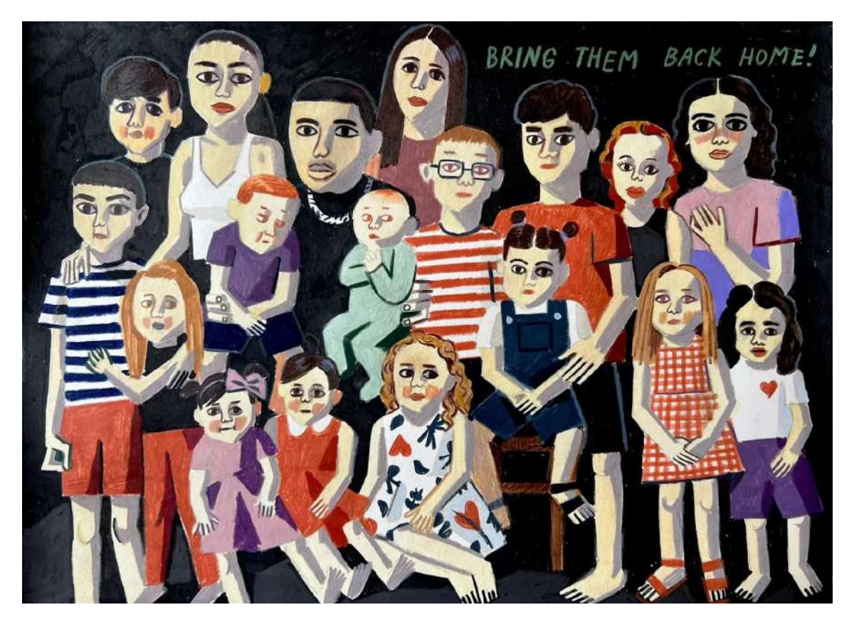
Zoya Cherkassky-Nnadi, BRING THEM BACK HOME! (The kidnapped children) , 2023, 11.5 x 16 inches, Watercolor, marker, colored pencil, and wax crayon on paper. © Zoya Cherkassky-Nnadi Courtesy of the artist and Fort Gansevoort.

No, it's the same. But as a member of the art world and a leftist, I have always been very critical of what's going on in Israel and especially with this current government that no normal person likes. I posted reactions to these pogroms that happened in Huwara, the village that was set on fire by settlers. But the art world has this habit, to criticise Israel. This criticism is right because it is against the occupation. But people don't know what happened this time. They just don't understand. This time it's so different and it requires a more complicated attitude, not black and white, not 'this is good and this is bad'. Not this identity politics that says, if you are Israeli you are automatically the aggressor. When people shout "To the river to the sea, Palestine will be free", I want to ask them: which river is that? Because I'm sure they don't know the name of this river.