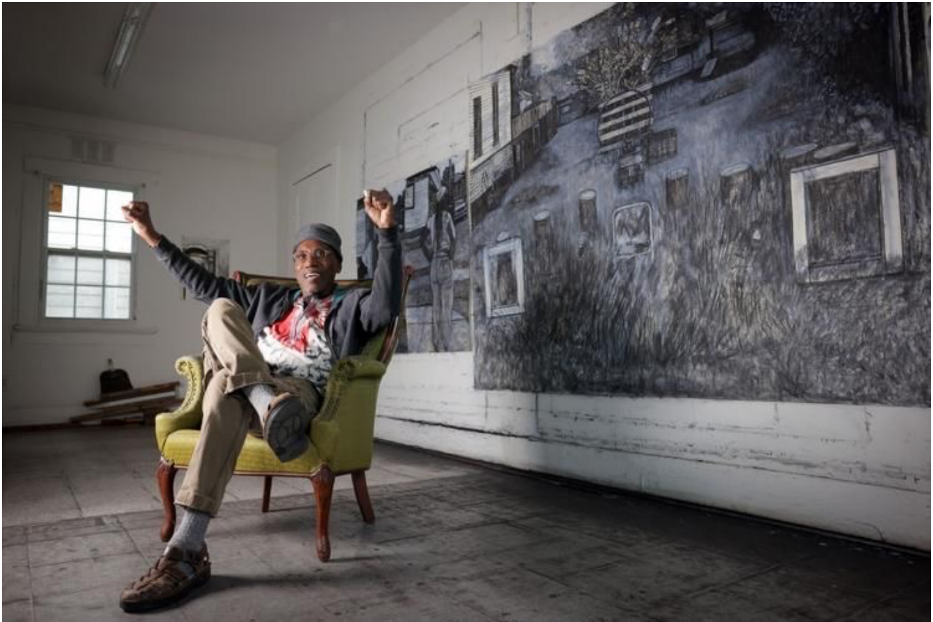
Artist Willie Birch is seen in his studio in New Orleans on Wednesday, November 29, 2023.

Artist Willie Birch is on a mission. He invested his nest egg in a sometimes-forgotten patch of the 7th Ward that he considers a hidden gem. Birch says the neighborhood is a perfect example of the modest urban architecture built and occupied by the descendants of former enslaved Africans, plus immigrant Irish and Sicilians, the working-class folk that helped make New Orleans what it is.