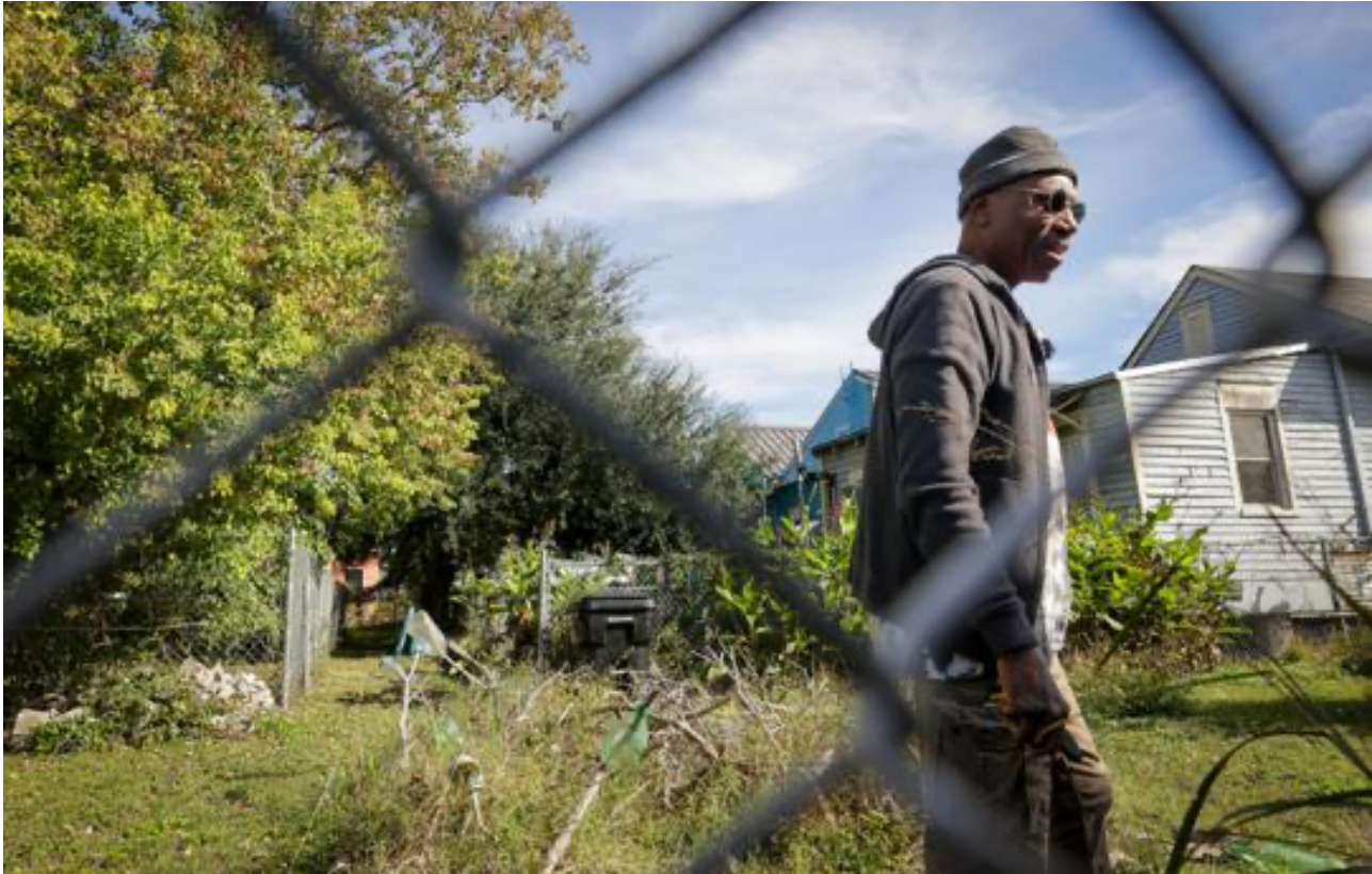
Artist Willie Birch walks in an art garden near to his studio in New Orleans on Wednesday, November 29, 2023.